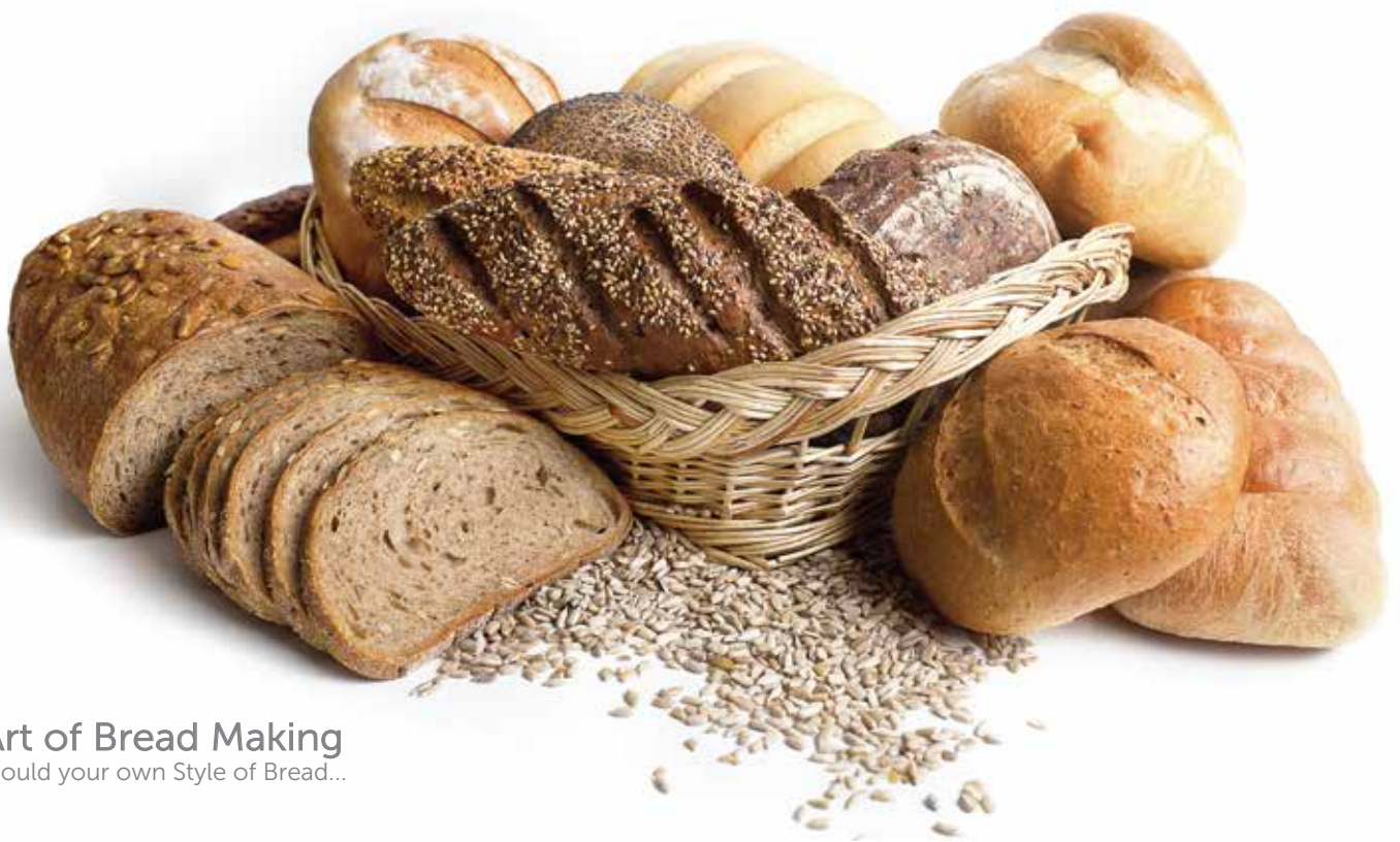
Art of Bread Making Mould your own Style of Bread...