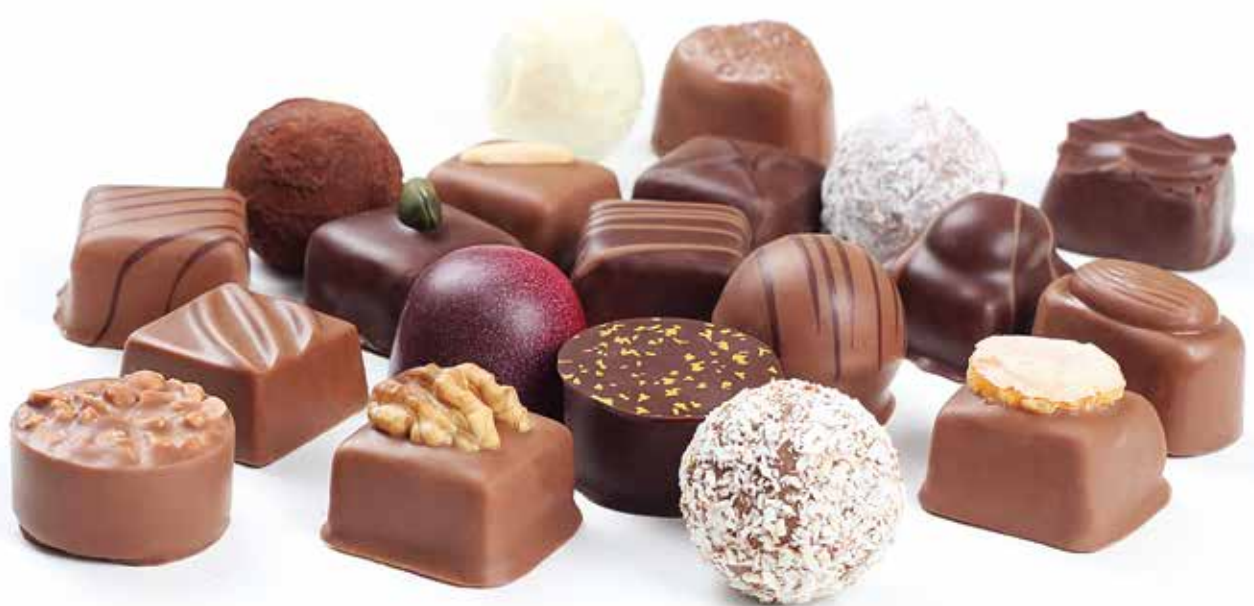
Art of Chocolate Making Mould your own Chocolate..